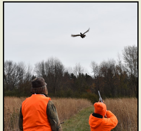
ROOSTER!!!! - This youngster knows what to do! I bet he'll be back this year! (Fish & Game Photo by Toni Dobbs).