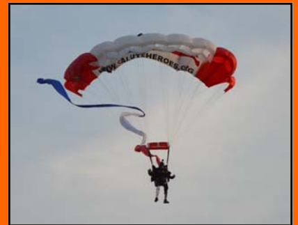
Drop by the Club!