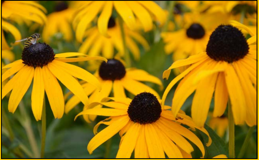
Black-eyed Sweet Things - Black-eyed Susans are a sure sign of summer ending soon and they add great pops of color to any roadside or flower bed. They are also among the favorite blossoms for Honey Bees. (Fish & Game Photo by Tim Ankeney).