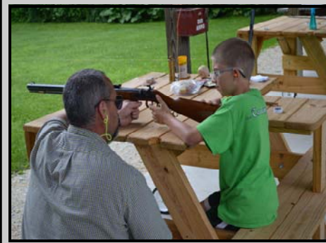
Good Advice! - This young shooter is being assisted by Greene County's own "Top Gun" during a recent JOTD event.