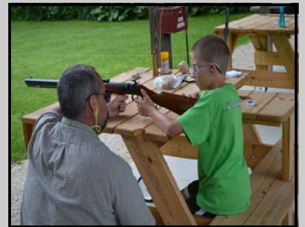
Good Advice! - This young shooter is being assisted by Greene County's own "Top Gun" during a recent JOTD / JAKES Day event. Fish & Game Photo by Tim Ankeney).

Remaining 5 - Stand Sporting Clays Shoot Dates: 6/27, 8/15 & 10/24.