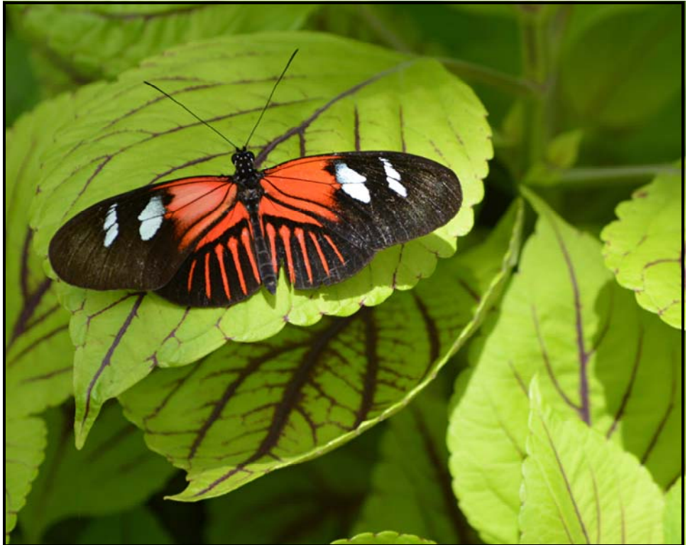
Like Butterflies? The "Butterflies of the Philippines" are on display through June 21st at the Krohn Conservatory in Mt. Adams (Cincinnati). This is a unique opportunity to view some of the most colorful butterflies in the world and a wonderful opportunity for amateur shutterbugs to capture some great images.