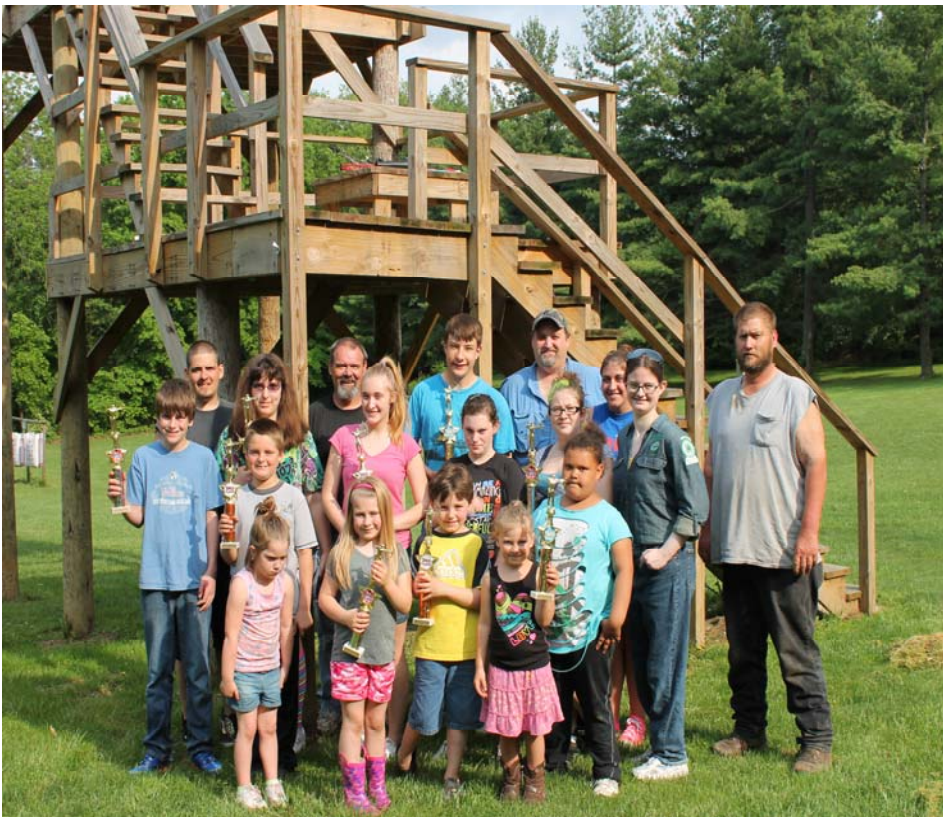
Stick Flingers of the Future - A fine group of youth archers took part in the first youth archery match of the year on May 18th. Most of that group is pictured above along with their volunteer instructors. Trophies were awarded to the top three shooters in the three different age groups. (Greene County Fish & Game Photo by Larry Rowland).

TRACK YOUR MEETINGS & WORK HOURS ON OUR WEBSITE: